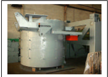
10MT MINI HEEL